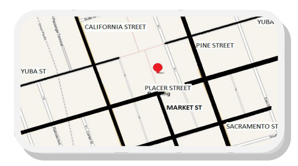
1643 Market St, Shasta Co. Elections Office South End of Market Street Promenade, Near 3-way Stop at Market & Placer